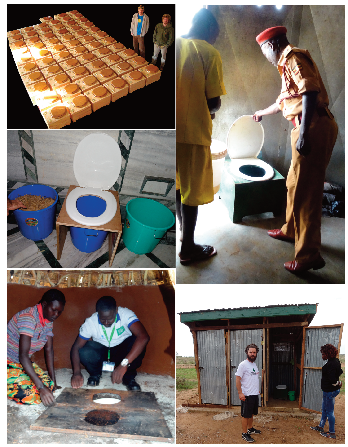
Humanure Composting Condensed Instruction Manual — HumanureHandbook.com