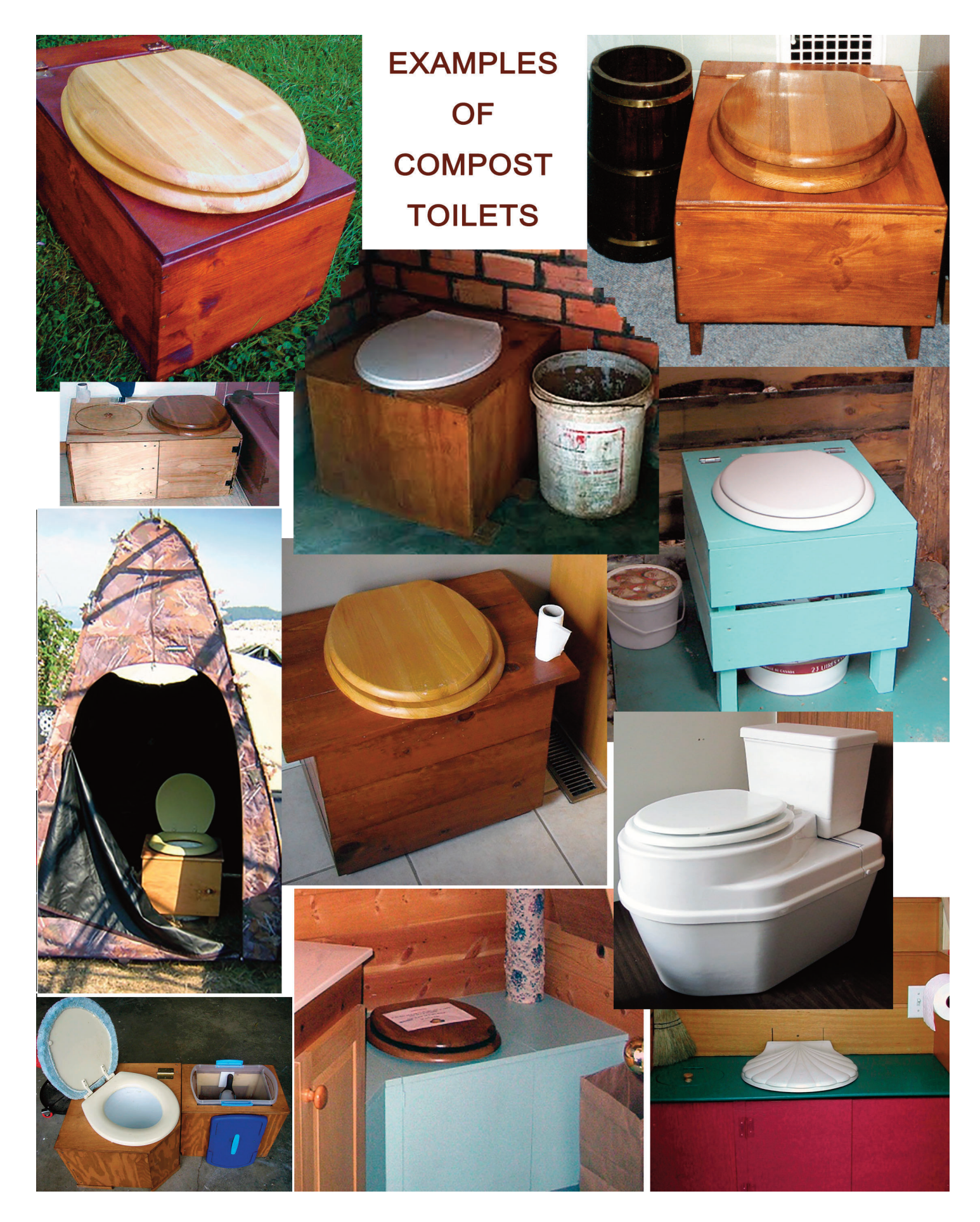
Humanure Composting Condensed Instruction Manual — HumanureHandbook.com